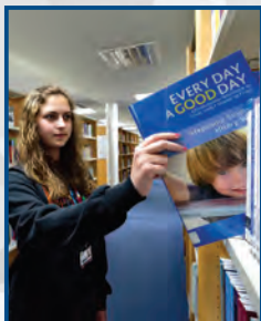
12 Female Wirral Met Student Taking a Book from the College Library