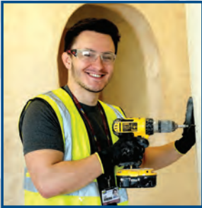
1 Wirral Met Construction Student Drilling into a Wall